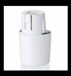
Extra rechargeable battery ensures a charged battery is always available

The CS 1500 camera comes with all the accessories you need to make the most out of the system, including a sample pack of disposable hygienic sheaths, two batteries, and a camera holder. Ask your local dealer about all available accessories.