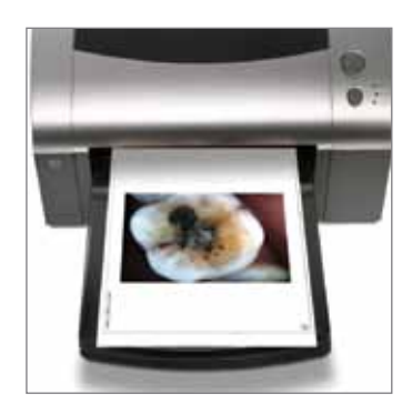
Print the image on any kind of printer.