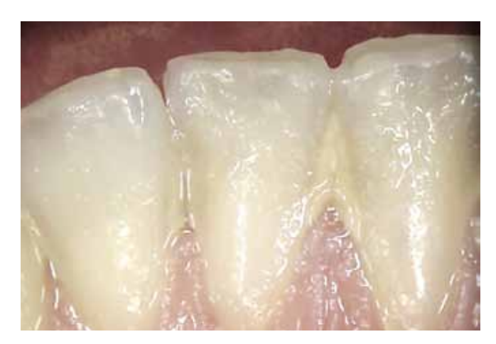
High-resolution images reveal even the tiniest details.