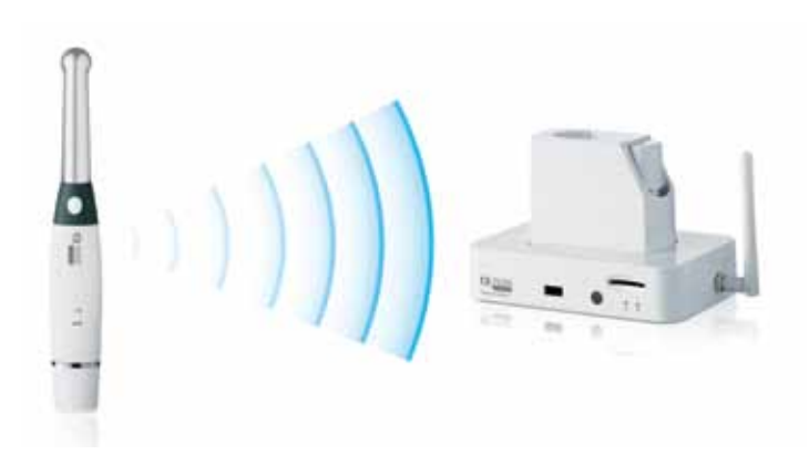
Built-in digital Wi-Fi for reliable and fast image acquisition—no wire required.

Available in both wireless and wired versions, the CS 1500 camera's wireless configuration features state-of-the-art Wi-Fi technology to ensure the most flexible and mobile solutions for your imaging needs. Offering faster transmission times, more stability, and less noise than analog wireless devices, the CS 1500 camera provides maximum reliability, while delivering the same image quality as the traditional wired version.