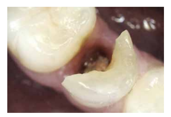
Receive crystal-clear views and true-to-life colors.

Weighing as much as 50% less than other wireless cameras, the CS 1500 camera ensures maximum comfort for its users. Easy to maneuver, the camera's lightweight handpiece makes exploring even the most hard-to-reach areas simple. Don't let its size fool you, however; the CS 1500 camera has been designed for superior reliability. And the neutral, stylish design ensures that the camera fits into any practice décor.