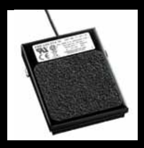
Optional foot pedal