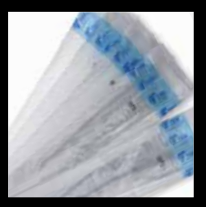
Disposable hygienic sheaths