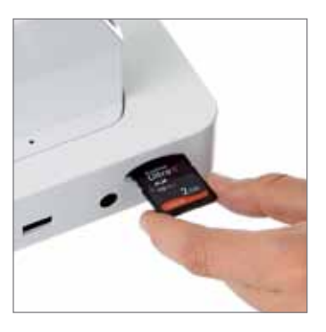
Save the image to your computer or SD card.