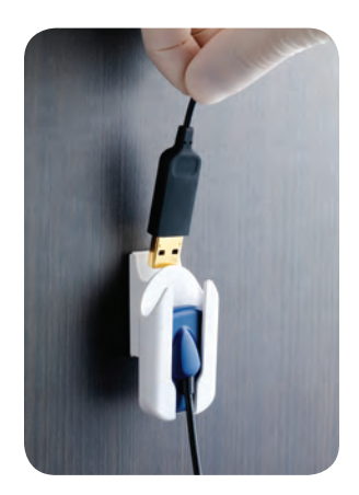
The wall-mount cradle safely stores the sensor and USB connector

NOTE: Visualix eHD sensors and GXS-700 sensors can be installed and operated on the same computer with no driver conflicts. GXS-700 digital intraoral sensors are Certified Class IIa medical devices.