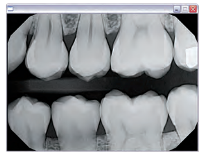
Easily capture both horizontal and vertical bitewings