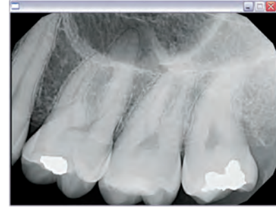
Effortlessly capture high definition images of challenging areas such as third molars and long-rooted canines

Utilizing the latest sensor technology, the GXS-700 system delivers real-time images of truly amazing clarity and detail — greatly supporting diagnosis and treatment.