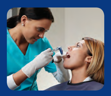
Sensors fit easily and securely into the custom, color-coded holders